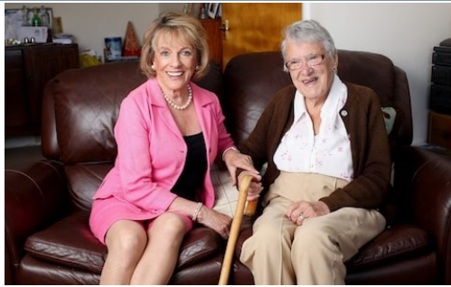
Dame Esther Rantzen, in Eltham, south east London, at the home of

It is the kind of thing we do already, but would it be helpful to give it some structure? Perhaps linked with our parish councils, churches and lunch clubs?